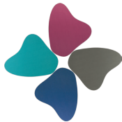
Pod of 4 35 sq. ft of classroom space