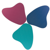
Pod of 3 31 sq. ft of classroom space

Synergy's multi-shaped options maximize collaborative workspace, while minimizing occupied classroom space.