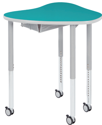
Standing Ht. 5200SH - Synergy Desk