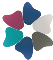
Pod of 6 44 sq. ft of classroom space