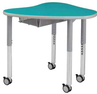
Standard Ht. 5200 - Synergy Desk