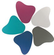
Pod of 5 40 sq. ft of classroom space