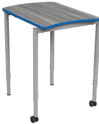
Adj. Ht. 4400A - S4 Student Desk (Shown in Driftwood Laminate and X-Strong Edge in Primary Blue)