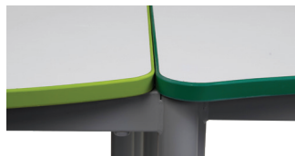
S4 Desk with PVC 3mm Edge in Lime Green and Primary Green