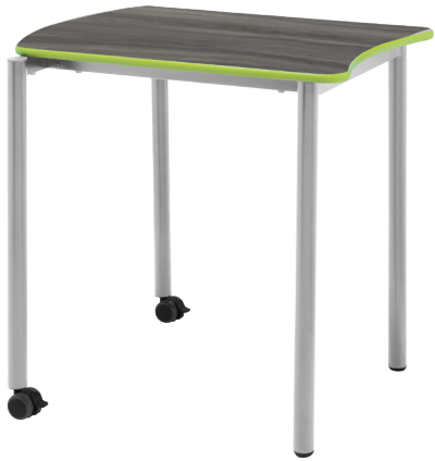
Fix. Ht. 4429 - S4 Student Desk