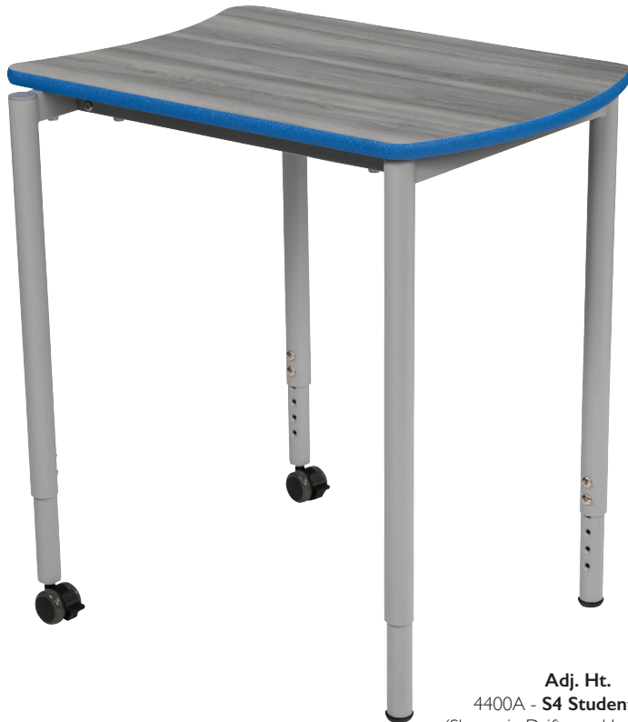
Adj. Ht. 4400A - S4 Student Desk (Shown in Driftwood Laminate and X-Strong Edge in Primary Blue)