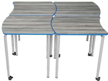
Pod of 4 PVC 3mm Edge