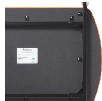
Fully Unitized Frame