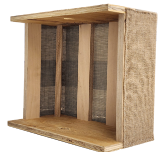
Inner Mod Frame