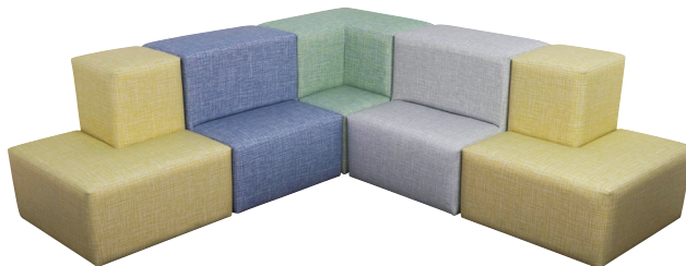
Configure in Groups 8848 - Outside Corner Mod®, 8818 - 2 Step Mod® & 8838 - Inverted Corner Mod®