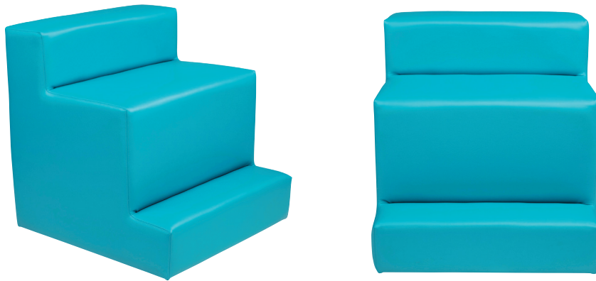
8828 - 3 Step Mod®