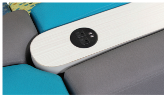
Configuration with RE-SHF - Power Shelf