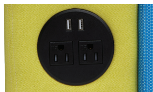
Arm Rest with Flush Power Port