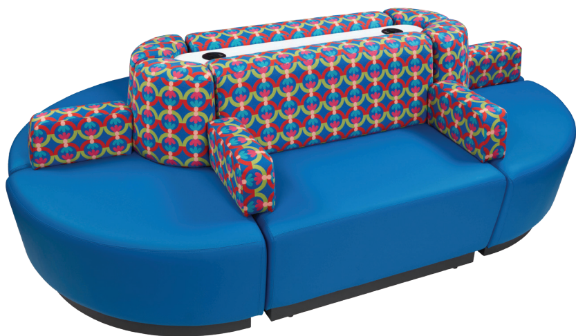
NEW Oval Configuration with Floating Arms (REB36-FLT, RE26-0-FLT and RE36-SHF)