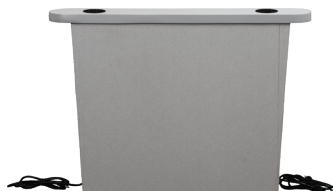
RE-SHF - Power Shelf

Power: Various power port options available on front of Armrests, Bench sides, or Power Shelf.