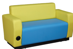
REB42-ARM - NEW Bench with Back and Arm Rest