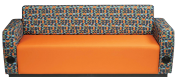
REB62-ARM - NEW Bench with Back and Arm Rest