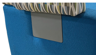
Floating Arm Rest Flush Metal Plate