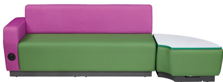
Bench with Back and Arm Rest Configuration (REB62-ARM, RE28-I-LAM with Laminate Top)