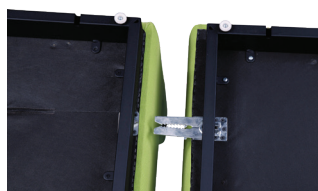
Underside Base and Glide with Standard Ganging