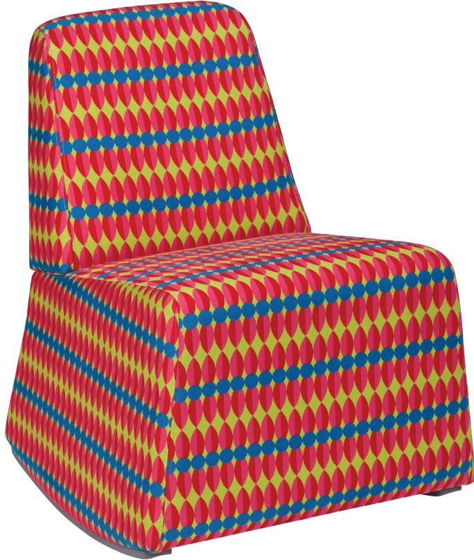
REB20R - NEW Re•Group Rocker Chair