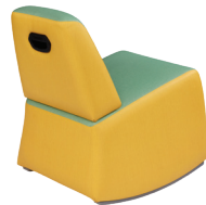
REB20R - NEW Re•Group Rocker Chair (Back View with Built-in Handle Bar)