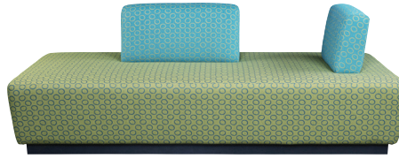
RE86 - Chaise Lounge