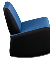
REB20R - NEW Re•Group Rocker Chair (Side View)