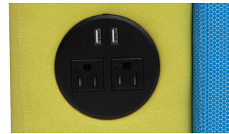
Bench with Flush Power Port