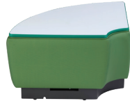
RE28-I-LAM - Inside Corner