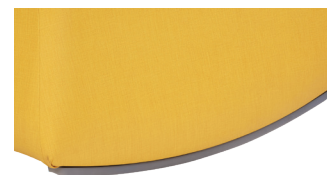
Rocker Chair Twin Rubber Glides Base