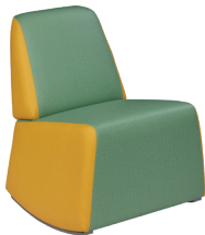
REB20R - NEW Re•Group Rocker Chair (Front View)