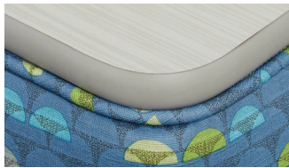
Laminate Ottoman with Signature Welt Piping

Power: Various power port options available on Bench sides, or Power Shelf.