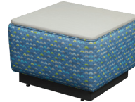
RE24-LAM - Ottoman