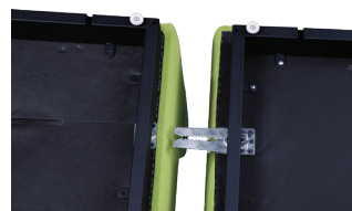
Underside Base and Glide with Standard Ganging