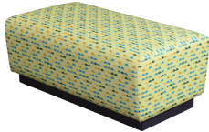
RE42 - Bench