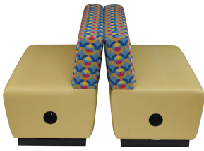
REB42 - Bench with Back (With Flush Power Port)