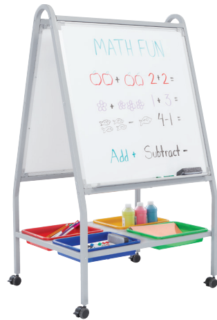
7700 - Mobile Easel (Accessories shown not included)