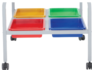
Mobile Easel Storage Compartments, Unitized Frame & Locking Casters