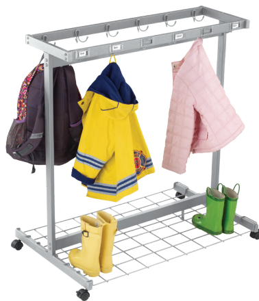
4670 - Mobile Knapsack Rack (Accessories shown not included)