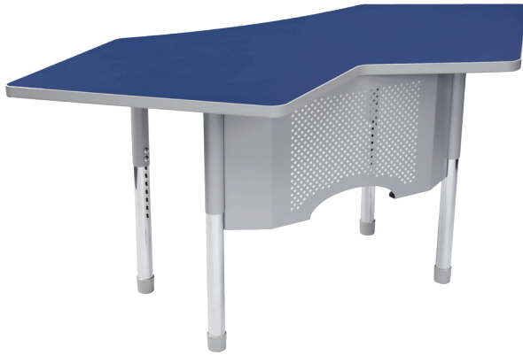
TS-2868 - Lazer Teacher Desk