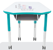
Jr. Petal Desk See page 54-55