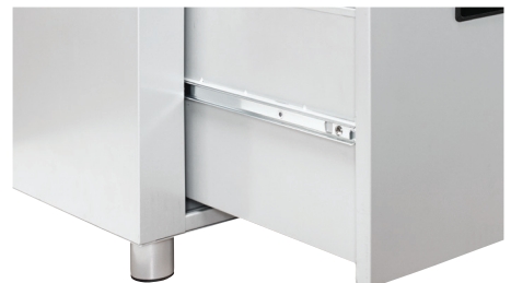
Drawer Suspension Pull-Out