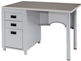
TS-3048 - Single Pedestal Desk (Shown in custom laminate Formica Smokey Brown Pear #5488)