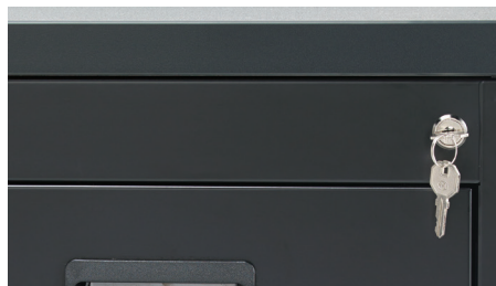
Built In Lock