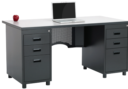
TS-3060 - Double Pedestal Desk