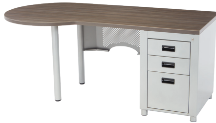
TS-3672P - Left Handed Peninsula Desk (Shown in custom laminate Formica Smokey Brown Pear #5488)