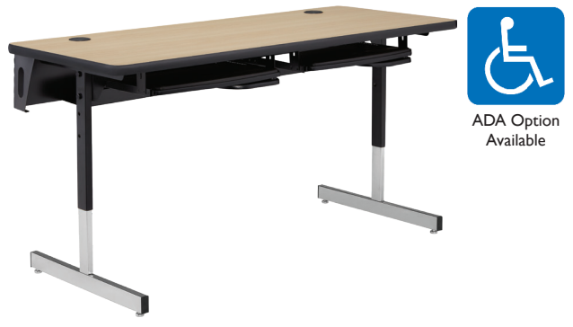
TLG-2460 - T-Leg Computer Table with Grommets (Shown with optional Keyboard Trays and Wire Management Tray)