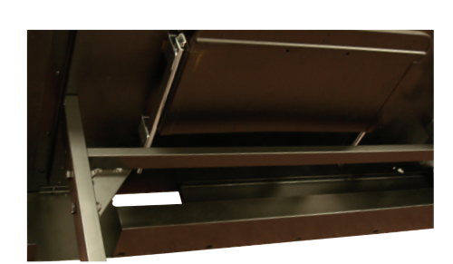
Stretcher Bar & Corner Braces