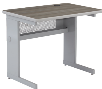
CL-2436 - Computer Table