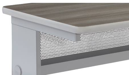
Built-In Wire Management & Modesty Panel

Optional Items: Casters, Connector Bridge, Keyboard Tray, Power Supply and Rubber Glides.