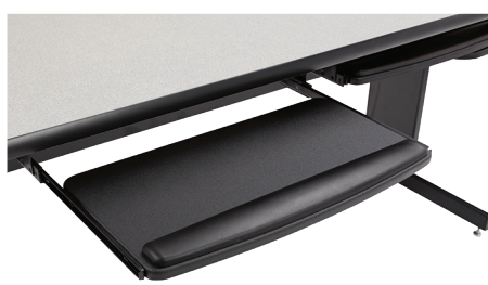
Optional Keyboard Tray