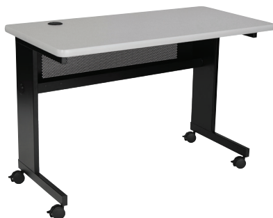
CL-2448 - Computer Table (Optional with Casters)