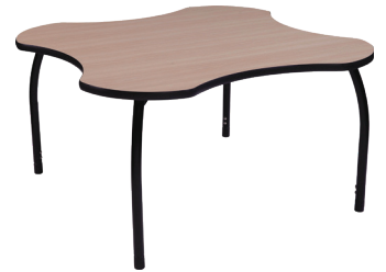
FL-4848CLV - Clover Table