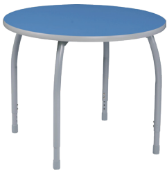
FL-36R - Round Table