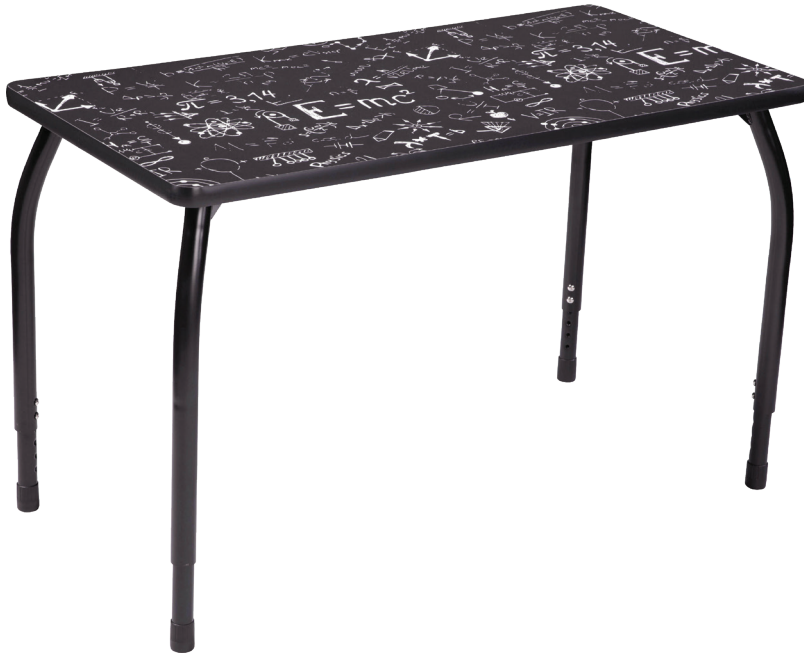
Adj. Standard Ht. FL-2448 - Rectangle Table (Shown in custom laminate Science Lab Chalkboard)