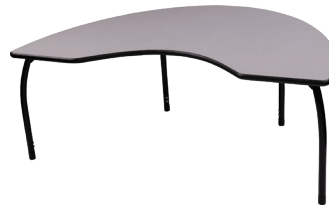
FL-4872K - Kidney Table