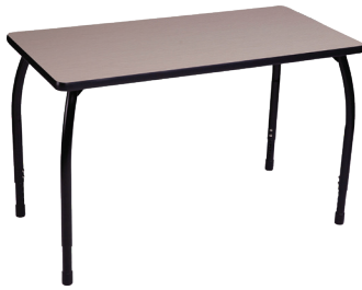
FL-2448 - Rectangle Table