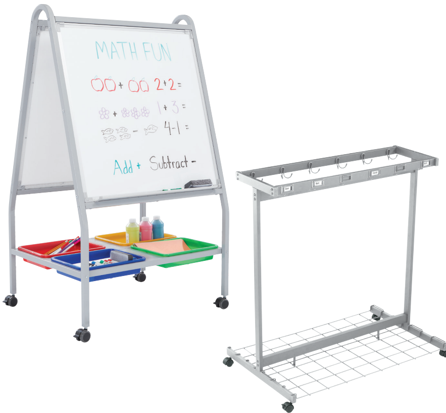
7700 - Mobile Easel & 4670 - Mobile Knapsack Rack (Accessories shown not included)