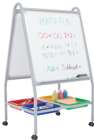
7700 - Mobile Easel (Accessories shown not included)