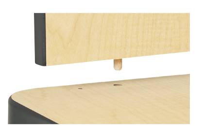
Easy Assembly with Dowels