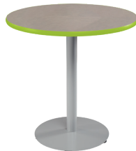
Jr Standing 36" Ht. Regular Base