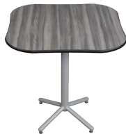
Standard 30" Ht. Regular or Quad Base