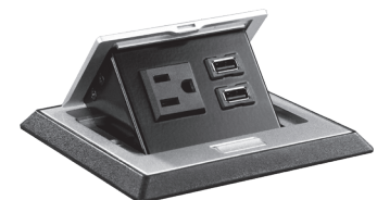
Optional Power Port

Optional Items: Power Port, Glide Caps (Felt, Rubber and Steel)