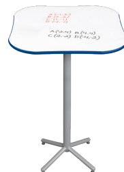
Standing 42" Ht. Regular or Quad Base