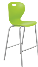
Z430G - 30" Zed Café Stool