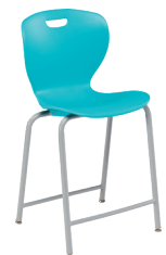
Z424G - 24" Zed Café Stool