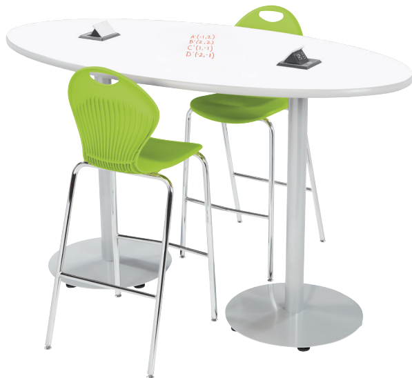
CFSH-3672OV & 7430 - Oval Table and Inspiration Boost Stool

*Available in Chrome-Plated, Gray (G) Powder Coating or Black (B) Powder Coating