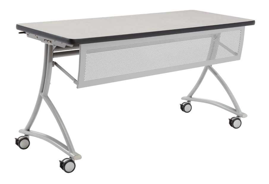
Fix. Ht. V2NMP-3060 - V2N Nesting Table with Modesty Panel