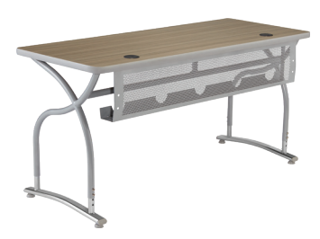
Adj. Ht. V2CO-2460 - Illustration V2 Computer Table