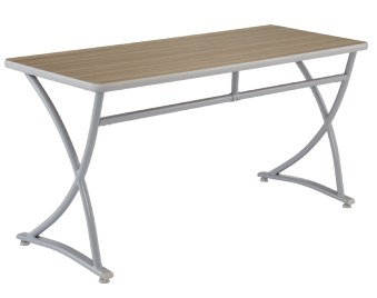
Fix. Ht. V2F-2460 - Illustration V2 Seminar Table