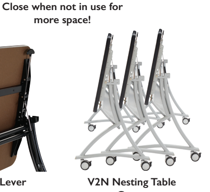
Group w/ Modesty Panel