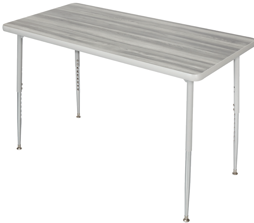
Standard Ht AL-2448 - Rectangular Activity Table (Shown in standard laminate Driftwood)