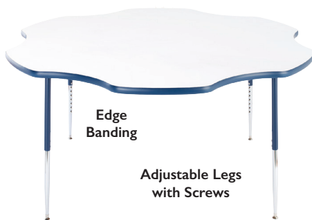
Standard Ht ALEE-6060FL - Flower Activity Table

*Educational Edge (EE): Color coordinated edge banding and legs.