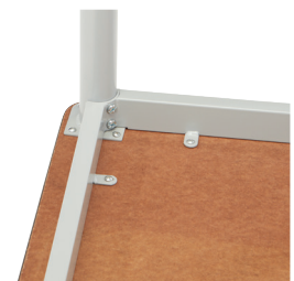
Fully Welded Strong Unitized Frame

Optional Items: Casters, Educational Edge (EE)*, Power Port, and X-Strong Edge**.