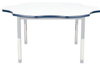
Adj. Standard Ht. WLA-6060FLEE - Flower Dura Table