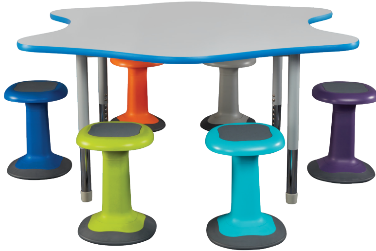
Adj. Standard Ht. WLA-6060ADEE - Adam Dura Table (Shown with Squircle® Active Seating Stool)