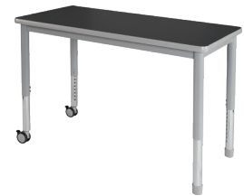
Adj. Standard Ht. WLA-2460 - Rectangle Dura Table (Shown with Wheelbarrow Option)