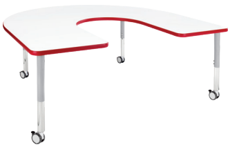
Adj. Standard Ht. WLA-6066HEE - Horseshoe Dura Table (Shown with Optional Casters)